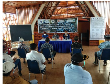
Formulation of the Heole-Olea Team