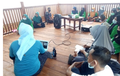
Sanitation and hygiene training