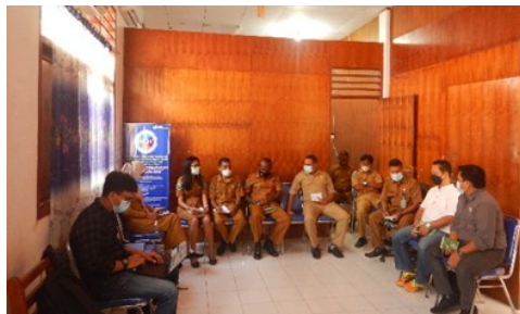
Meeting with Raja Ampat Cooperative and Small-Medium Business Enterprises Agency