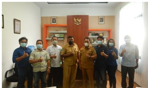
Meeting with Raja Ampat Tourism Agency