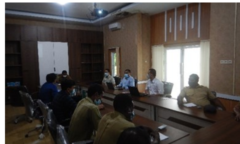
Meeting with Raja Ampat Fisheries Agency (DKP)