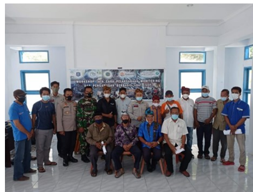
Adat-Based Monitoring and Surveillance Team