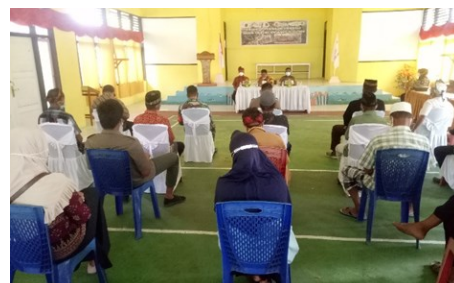
Sara Adat Kawati Workplan Workshop