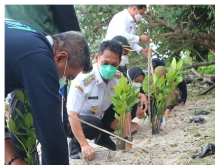
Wakatobi Regent Planting Mangrove