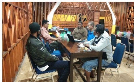
Discussion with BTNW (SPTN 2 and SPTN 3 to discuss annual workplan