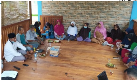
Women's Group Meeting