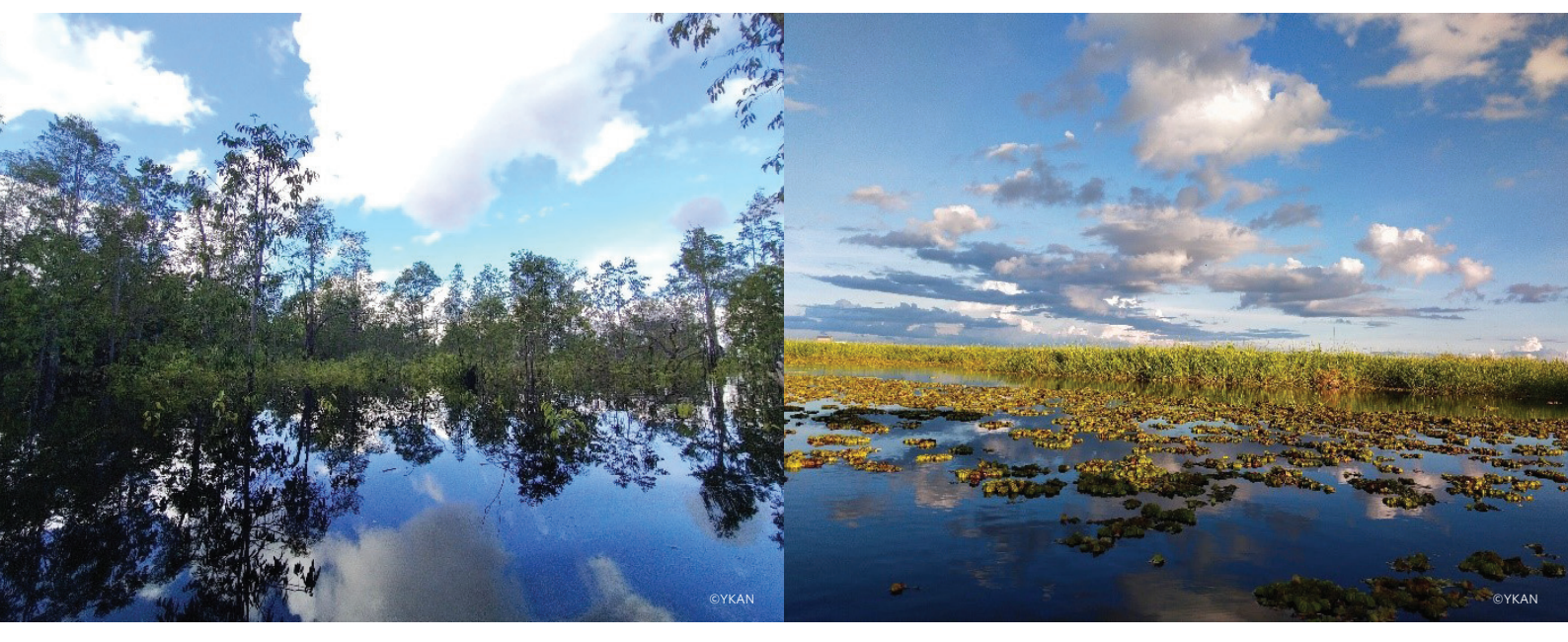
[figure 2] Muara Siran Peatland Ecosystem

"In Muara Siran, YKAN along with collaborators conducted a combined science and implementation project at one of the remaining natural tropical peat swamp forests in the heart of Borneo."